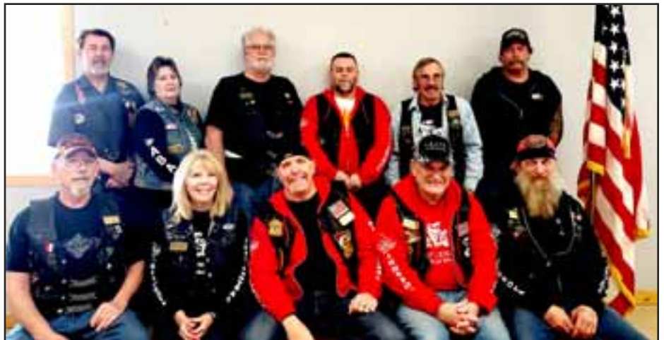
East Central New 2020 Officers

instructing the Sgt@Arms course at A.B.A.T.E. "U".