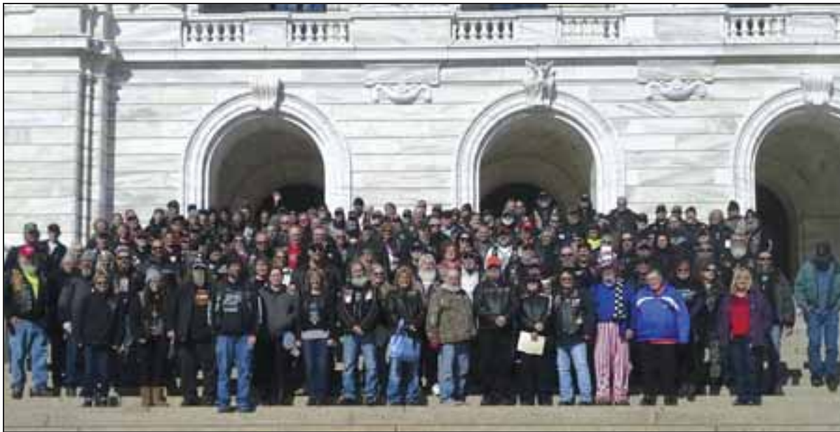
A.B.A.T.E. of Minnesota at 15 th Annual Bikerday at the Minnesota State Capitol on February 27, 2020.