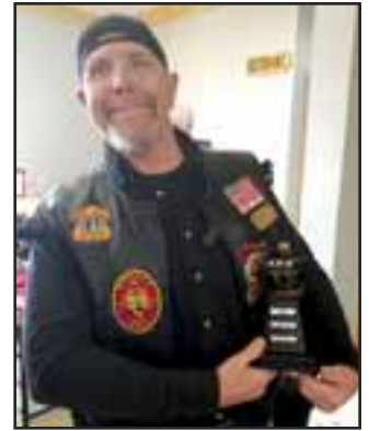
East Central A.B.A.T.E Heart On 2020