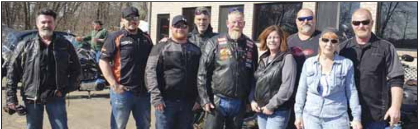
RIVER RIDERS: 2020 Officers and River Riders Chapter members.