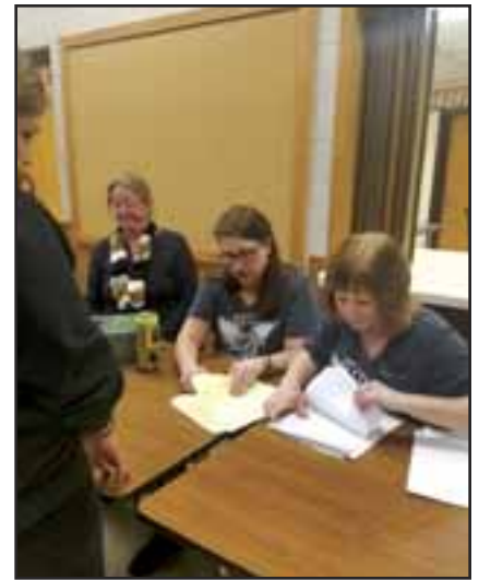
After the auction.