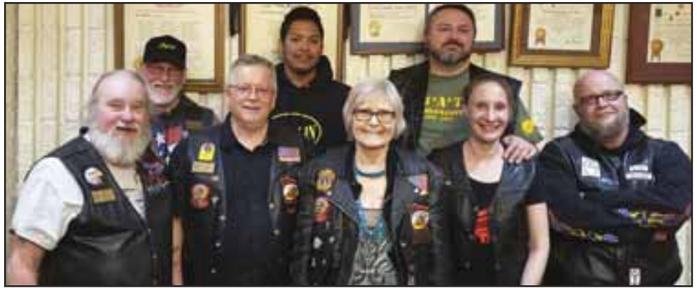
Metro A.B.A.T.E. Chapter Officers for 2020.