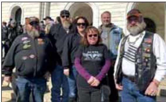
Heart of the Lakes Chapter