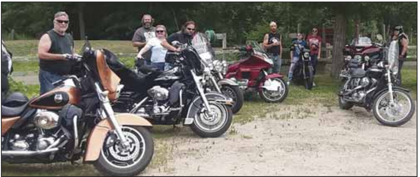
A Sunday Ride!