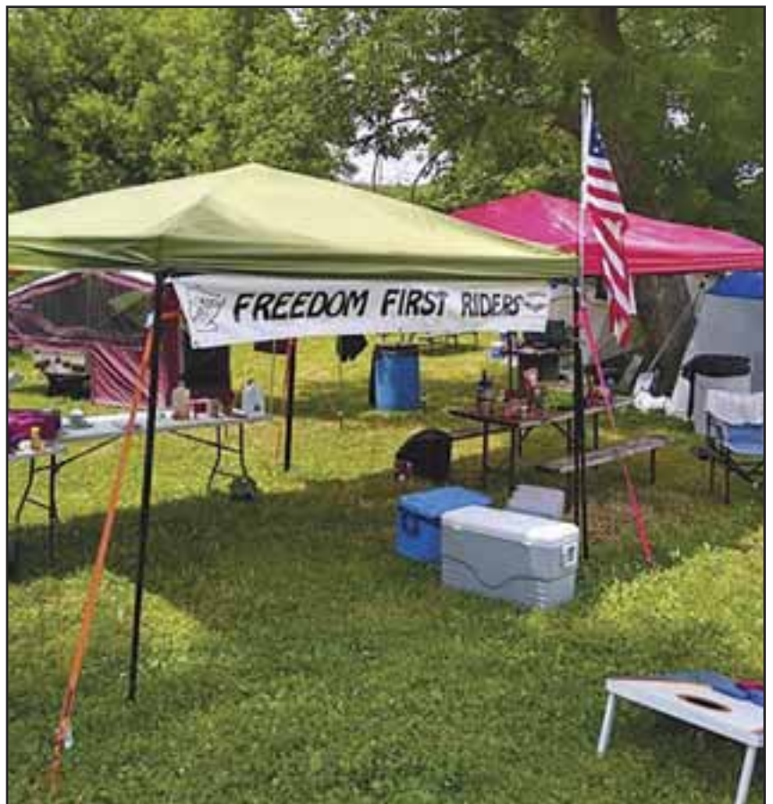
Camping in Algona.