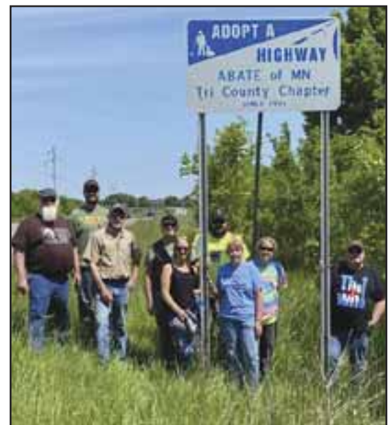
Highway Cleanup in June.