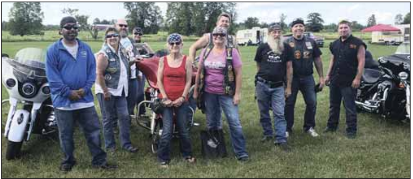
East Central ABATE chapter members at the NE District meeting.