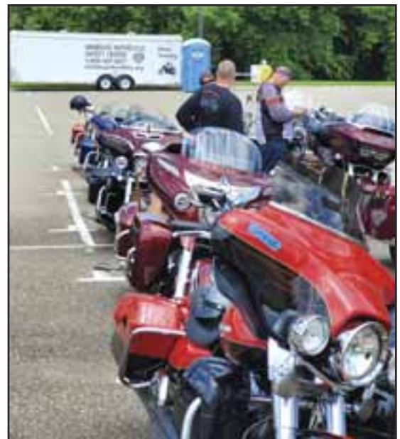
Intermediate Rider Course in June.