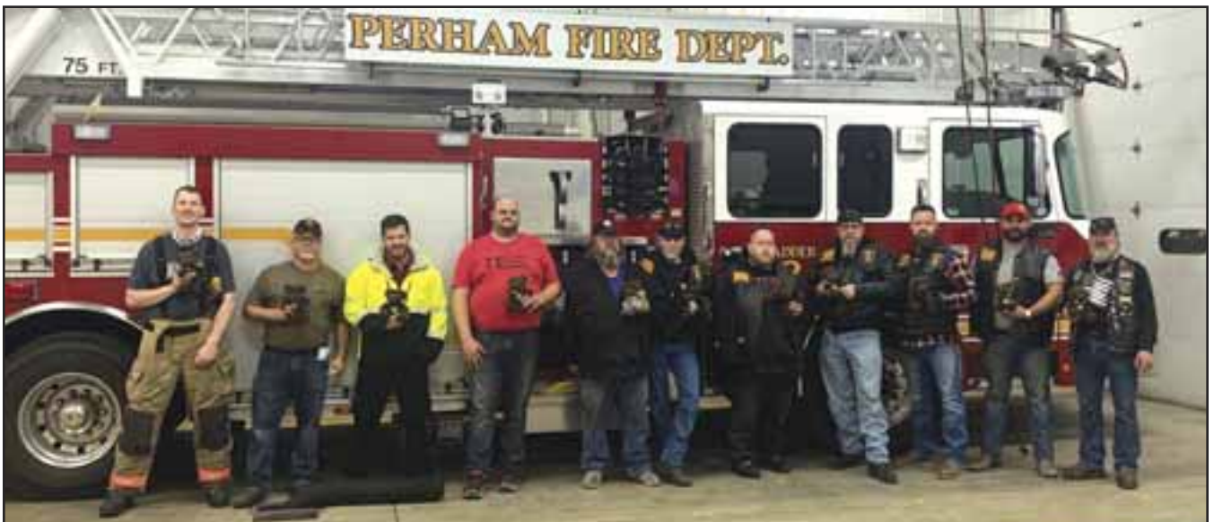
Heart of the Lakes Chapter Buddy Bear delivery to Perham Fire and Rescue.