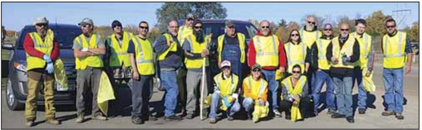
River Valley Ditch Clean up in October.