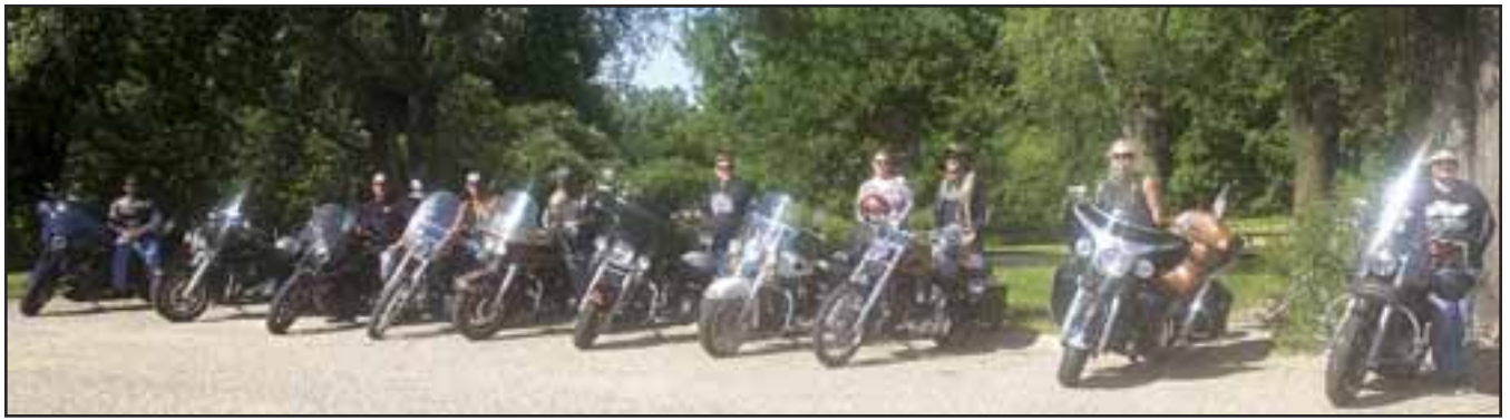
East Central A.B.A.T.E. Chapter members Advanced Rider Training Course.