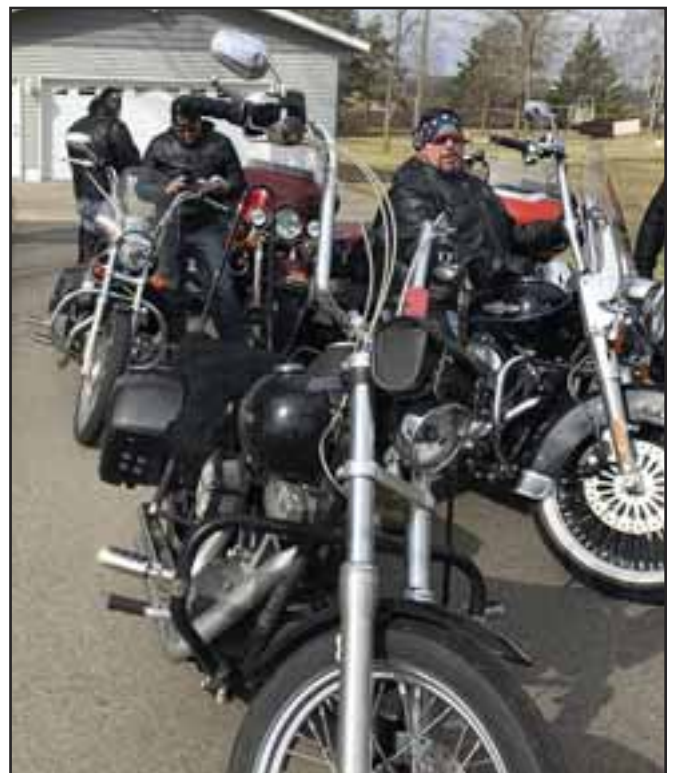
Saying "Hi" from a distance.