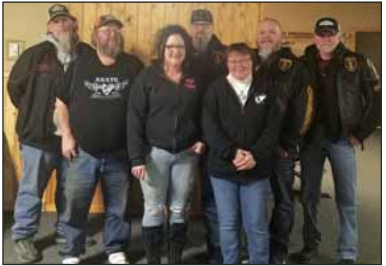
Heart of the Lakes

I'm sure at this time many of you are holed up at home trying to fill your days with something useful while you are sheltering in place. Or maybe you are considered "essential" and are trying to work as best you can with "social distancing". I, for one, am out working still, and trying to do my part to keep distance, wash hands, not touch your face. But until something like this comes up you never realize how many things we all touch, and how hard it is to stay back from people, especially when you are used to being social. I know we all look forward to this thing being over so we can hang together and have fun as a