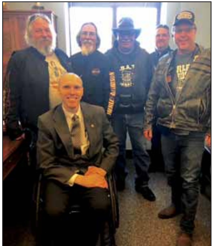
Southwest Chapter at BIKERDAY 2020.