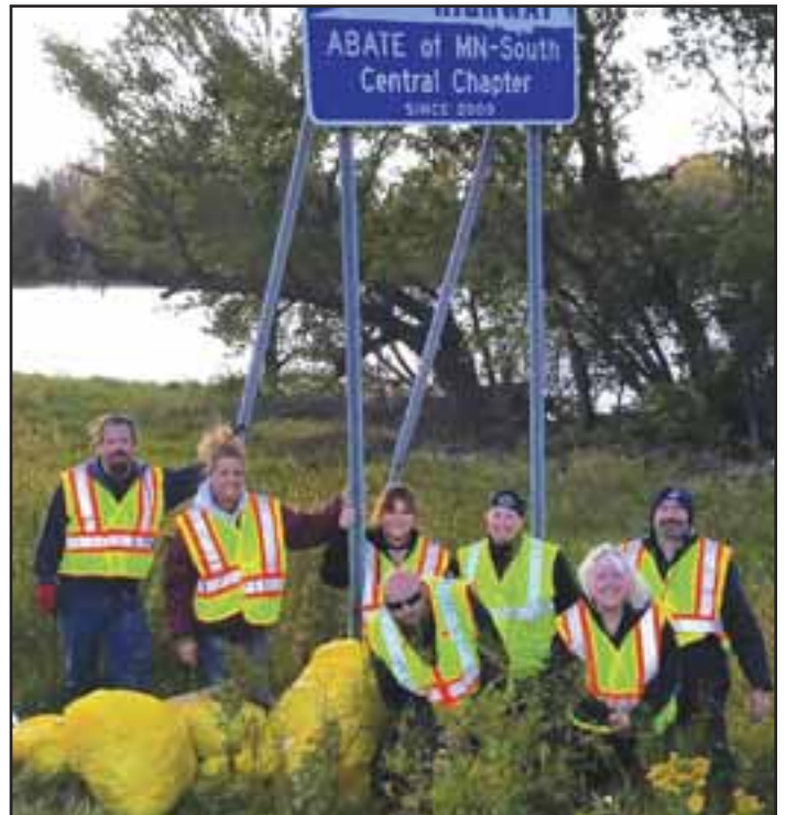
South Central Ditch Cleanup 2020.

Thank you to all that participated in this year's Passport Run. Understandably it was difficult to complete every stop due to the COVID-19 restrictions and the unfortunate closures of some businesses. Please continue to support and thank our