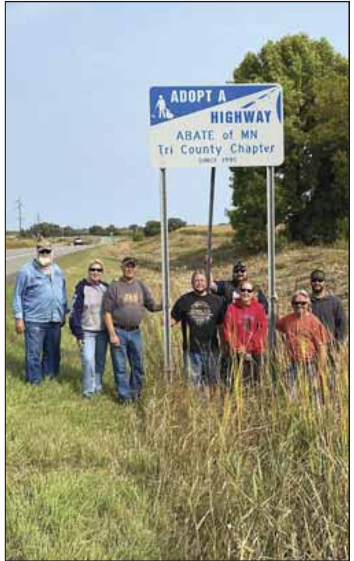
September Highway Cleanup.

Ok, back to motorcycles. Hopefully the weather is permitting, and you are still riding at this point. If not, we will get through winter to ride another day.