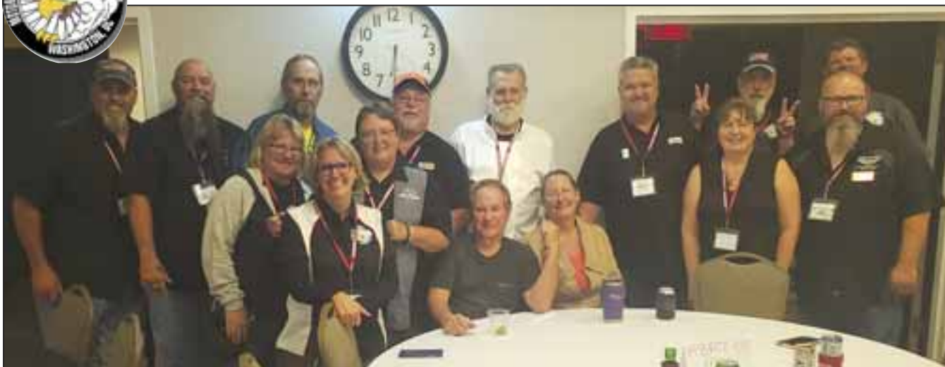
The Minnesota group at the Meeting of the Minds Conference in Indianapolis, Indiana.