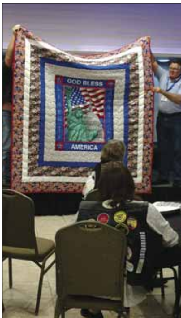
Quilt donated to the Meeting of the Minds Auction.