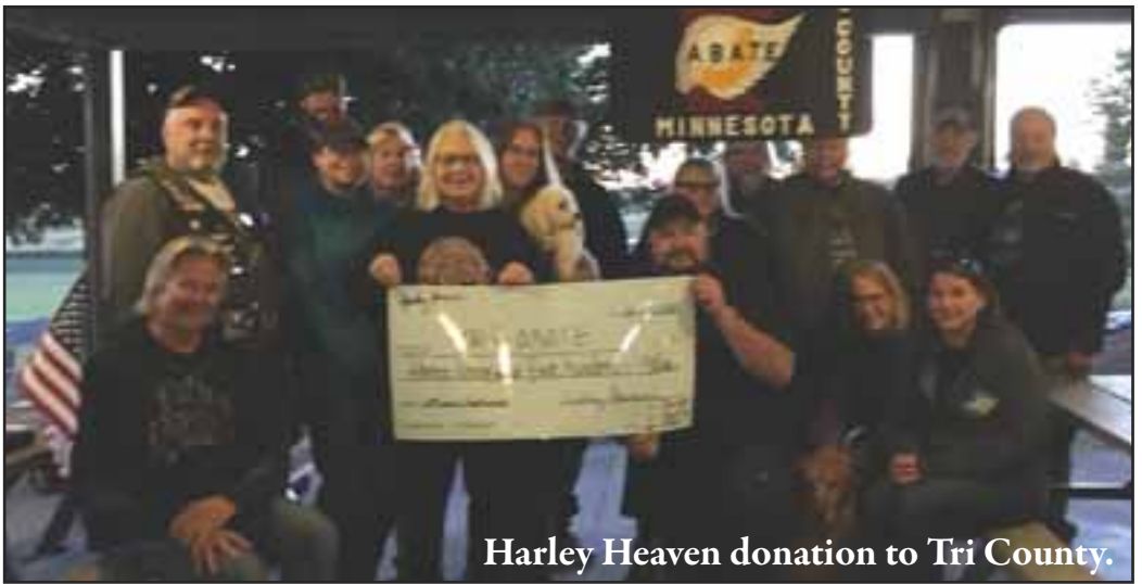
Harley Heaven donation to Tri County.

December 3 rd , Tri-County Christmas Party, Cy's Bar and Grill, Chaska, 6:30 pm