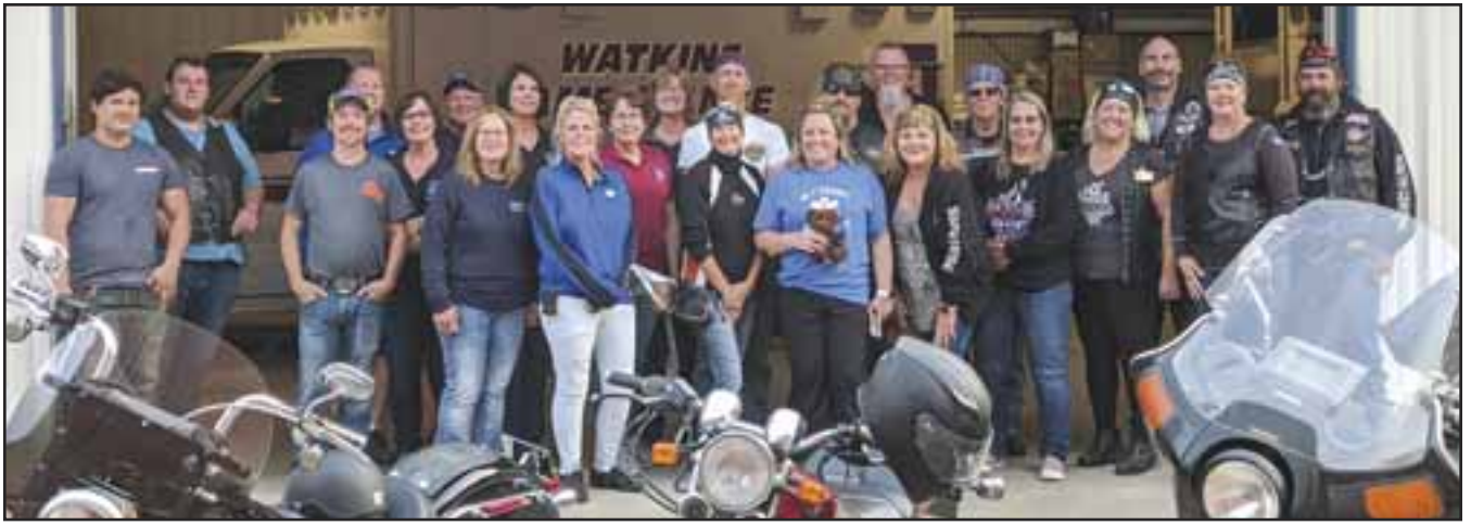
South Central delivering Buddy Bears 2020.