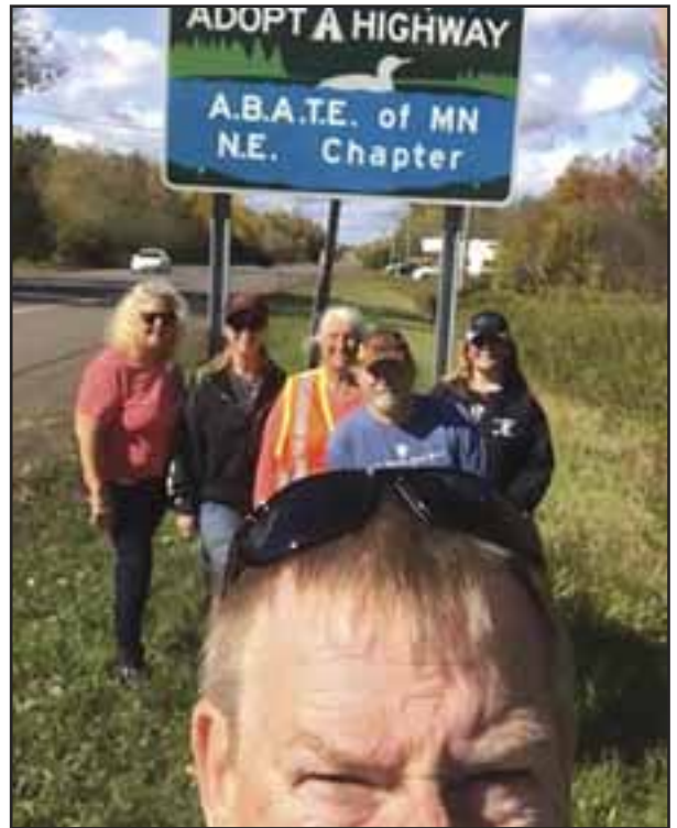
October road cleanup. Thank you to the participants!