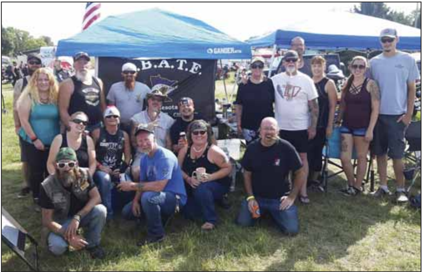
Sand Dunes Chapter at the 2020 Rally.