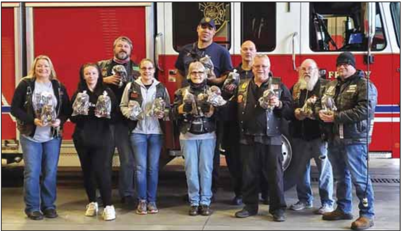
25 Bears went to the Fridley Fire House.