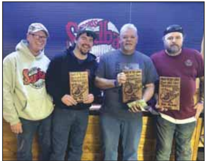
Heart of the Lakes Pool Winners!