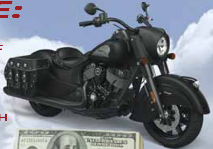
Photo of motorcycle is not the actual prize, but only a representation of prize to be given away. Indian Motorcycle purchased at: Mies Outland, Watkins, MN