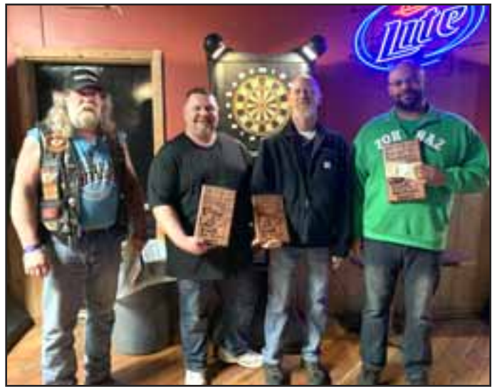
Heart of the Lakes Dart Winners!