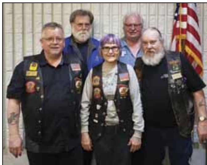
New Metro A.B.A.T.E. Chapter Officers.

By now you may have noticed that Metro Chapter did not have its legendary Winter Bash. We are back on!!! We are having the "Not the Winter Bash" bash! This will take place at Route 47 on Sunday, May 30 th from 1:00 - 6:00 pm. Now this isn't a buffet, this is a Sunday afternoon keg party for those folks not going up north for the holiday. We got food, beer, and some Southern