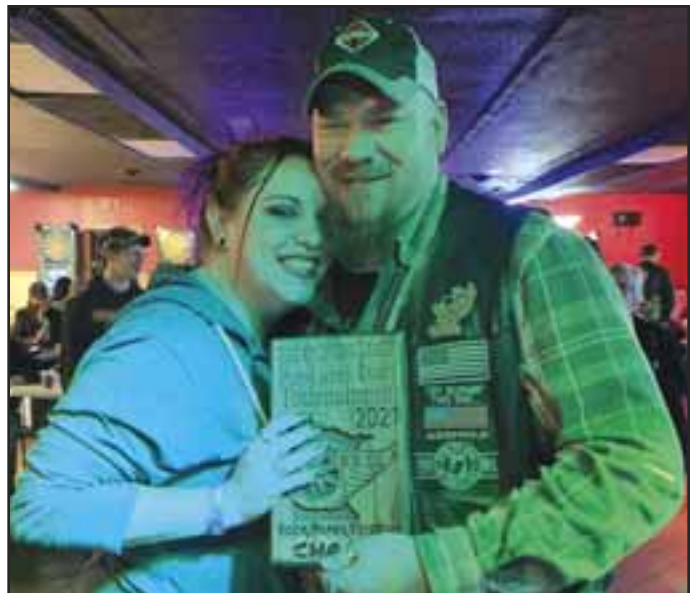
Heart of the Lakes Rock, Paper, Scissors Winner!