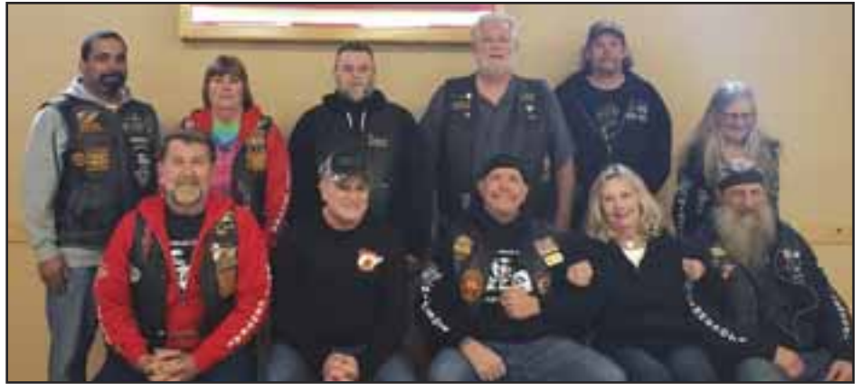
New East Central Officers