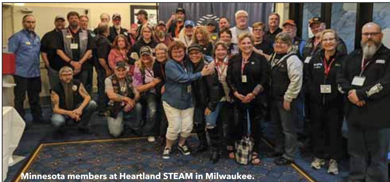
Minnesota members at Heartland STEAM in Milwaukee.