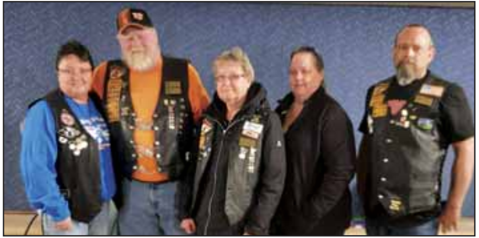
Rolling Prairie Officers (above) and Sgt. @ Arms (below).