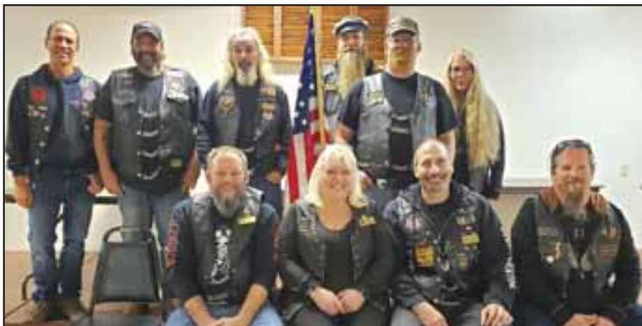
2021 South Central Officers

In June will be our annual Fun Run and Membership Drive, watch our Facebook group for more details. This will include 3 stops, burgers, and a camp out for all A.B.A.T.E. members.