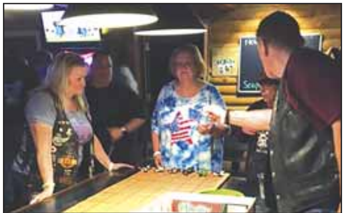
Bike Game at the "Bunwarmer."