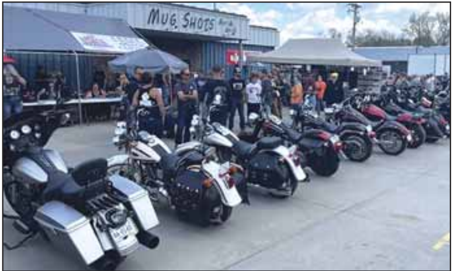
The Spring Fling Bike Show and Trophy Winners (below).

The Good Lord is Blessing us with a Beautiful Riding Season, and I am sure he is not wanting you to join his chapter just yet!!! Be safe and enjoy the