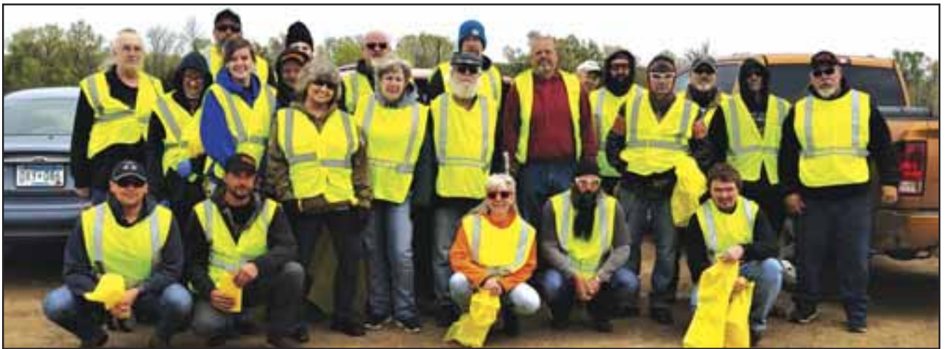
River Valley spring ditch clean up!