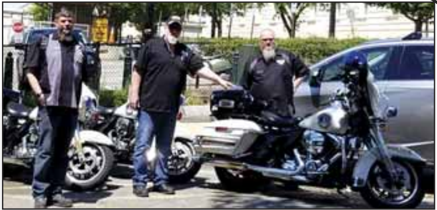
Minnesotans with the DC Police Bikes.

we are getting back to normal. People are starting to get out and enjoy their freedoms again. The State Capitol still is closed to the public but the security fences that were set up around the capitol are coming down. We are still having to communicate our motorcycle issues through emails, letters, phone calls and other types of video style meetings.