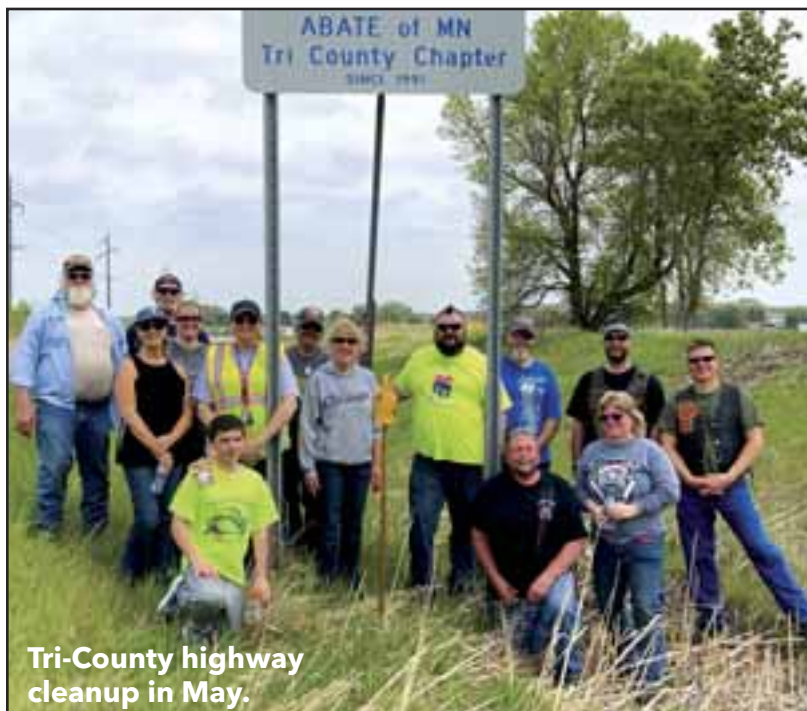
Tri-County highway cleanup in May.