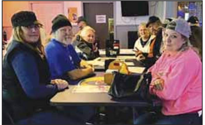
Road Cleanup Spring 2021, "Lunch after spring road cleanup."