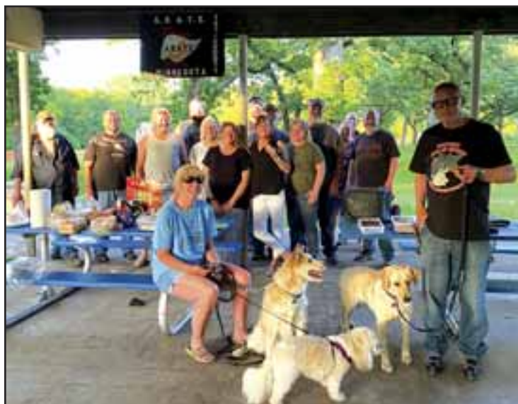
Tri-County meeting at Memorial Park in Shakopee. Right: The Grillmaster and his apprentice.