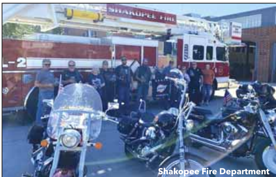
Shakopee Fire Department