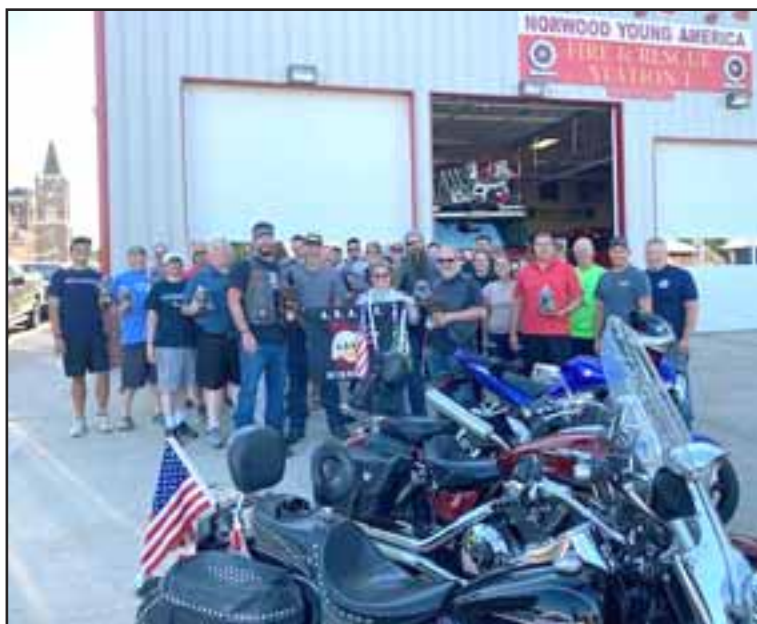
Norwood Young America Fire Department