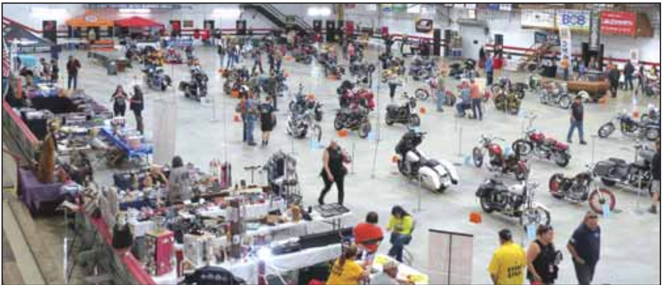
Ice rink almost ready for opening day of the 13 th Annual Freedom First Riders Bike Show.