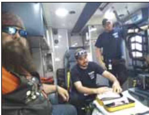
Flatlanders at the Algona Ambulance tour and presenting them with 10 Buddy Bears.