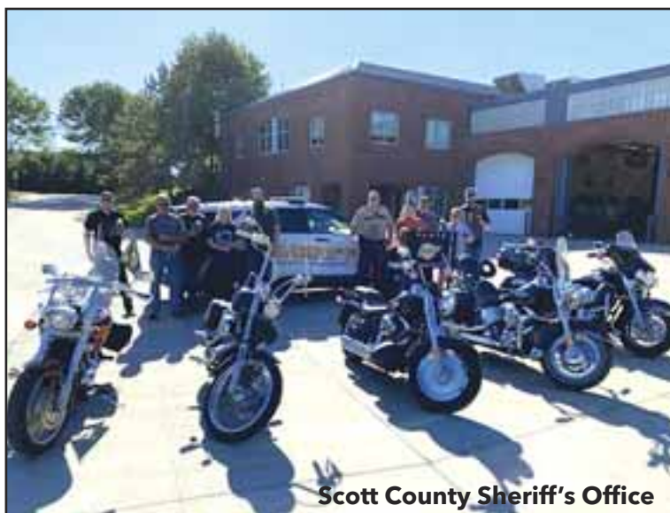
Scott County Sheriff's Office