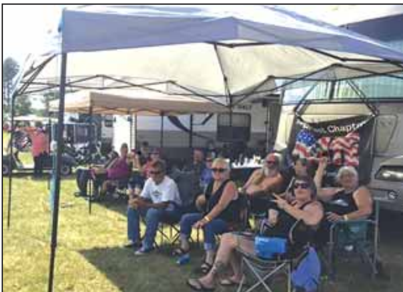
Northeast Chapter at the Shakedown sled pulls.