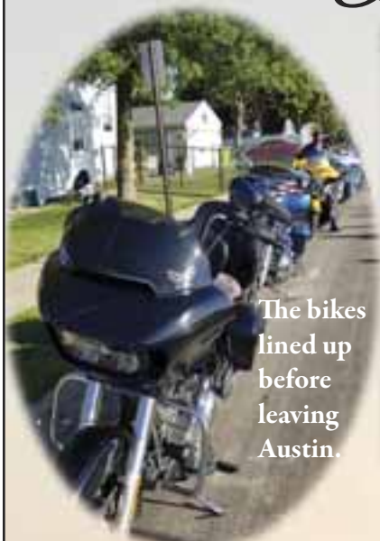
The bikes lined up before leaving Austin.