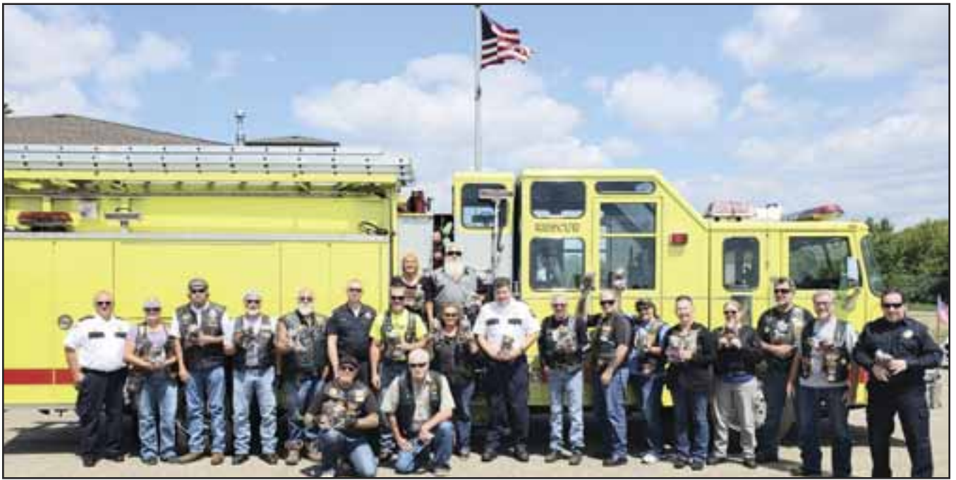
East Central A.B.A.T.E. Chapter Oak Grove Fire Department Buddy Bear delivery.