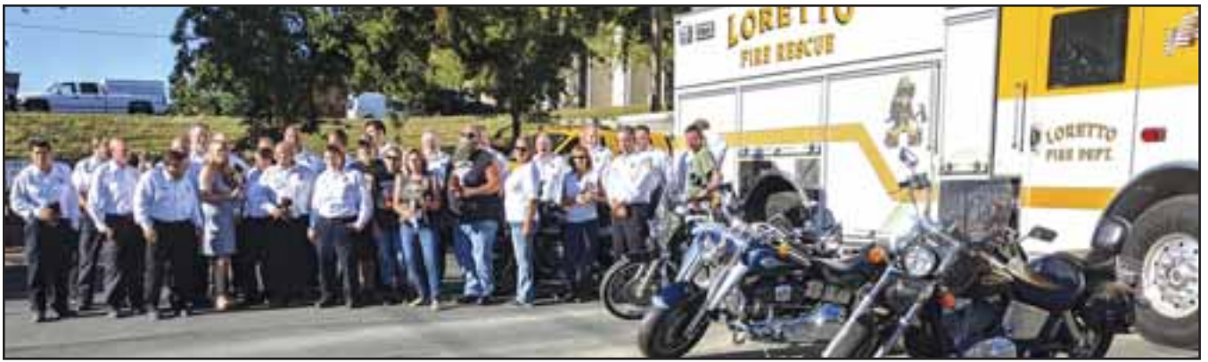
Lake Chapter Buddy Bear donation to the Loretto Fire Department.