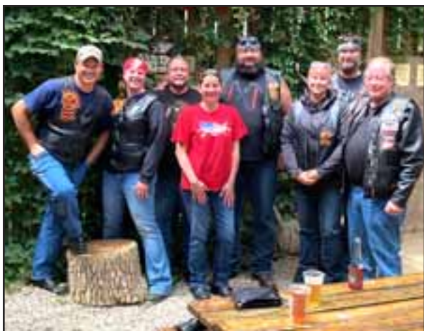
Tri-County on the Red Knights Bike Run.