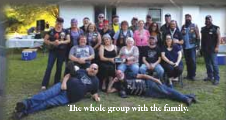
The whole group with the family.