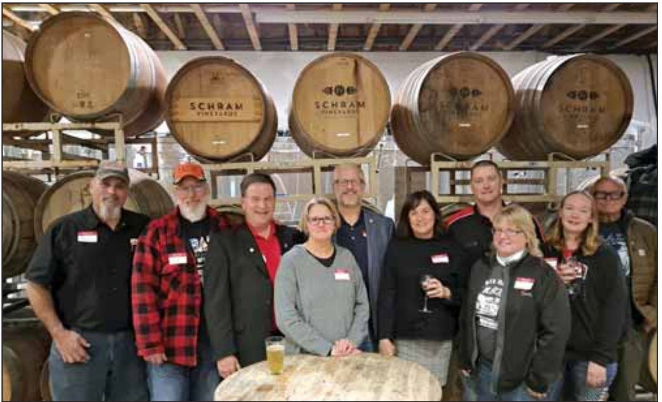
Lake and Tri-County members at Schramm Winery in Waconia.