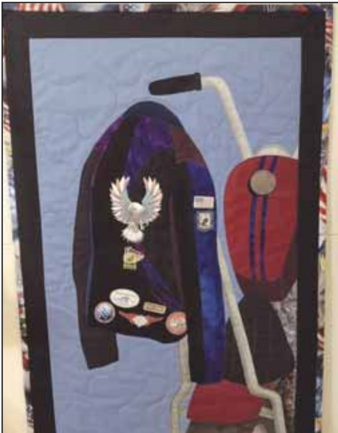
Grounded Hogs Party: Rosa's Quilt

TBD, Lake Chapter Experienced Motorcycle training