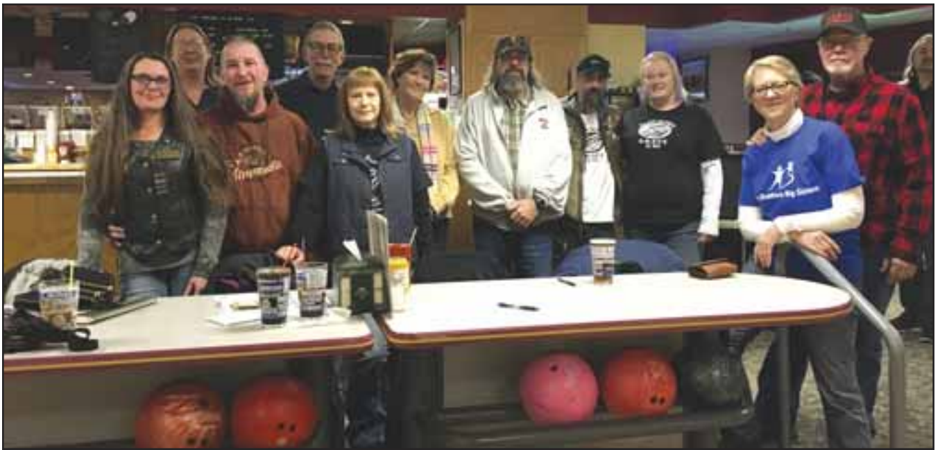
Lake: Bowling for Kids