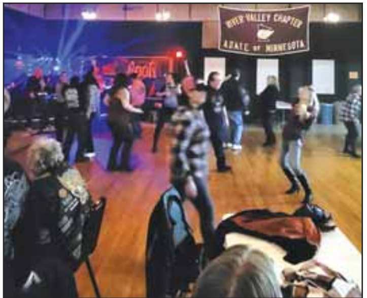
River Valley January Thaw Fundraiser