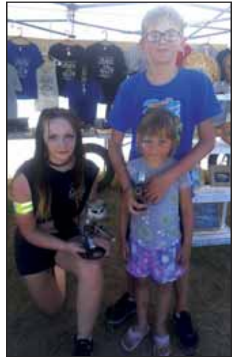
Young winners from last year's Bike Show and Rodeo.

Our next chapter event will be our spring ride, May 7 th , kickstands up at 11:00 am from KJ's Refuge in Orrock. This ride is the day before Mother's Day and in that spirit, we will be donating 10% of all proceeds to Motorcyclists of Minnesota PAC, or MOM-PAC.