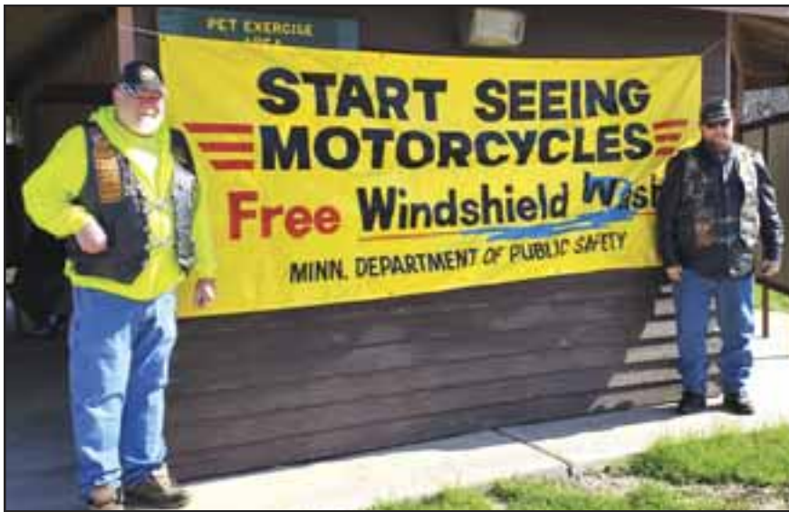
Rolling Prairie May Awareness Washout