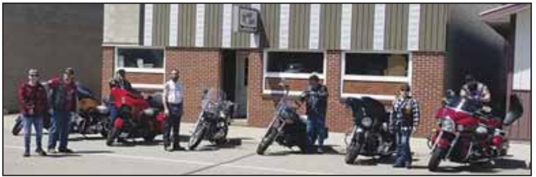
Freedom First Riders Group Ride.