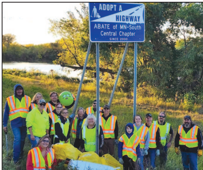
SC Fall Ditch Clean Up

Remember our fight for freedom doesn't get put on hold just because there is snow on the ground. So, when you hook up the battery tender and put in the fuel additive to your soon to be sleeping beauty don't be sad. Instead look at her and think OMG that was funny when or that was crazy shit when and man, that was the greatest time because happiness is living every day and we are so lucky and blessed to have each other to share it with.