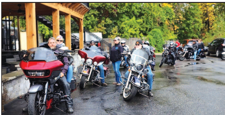
Freedom First Riders 2022 Fallen Members Ride