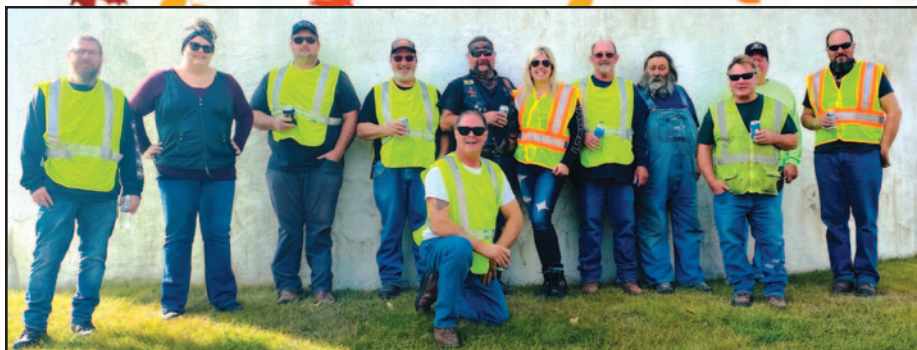
Adopt a Highway Ditch Pick