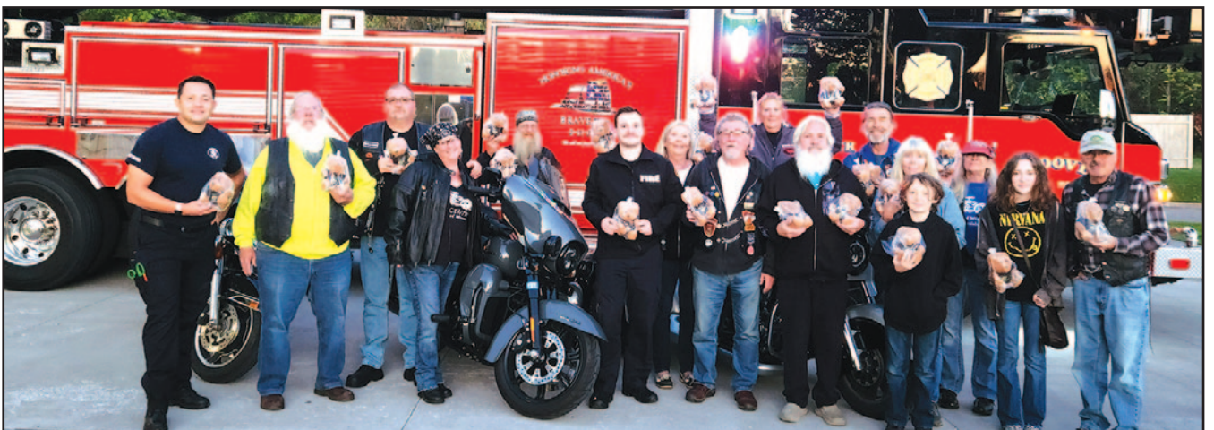
East Central Buddy Bear drop at Andover Fire Station (see East Central report on next page.)