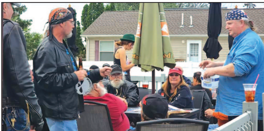
Billboard Run Raffle.