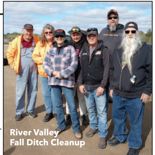
River Valley Fall Ditch Cleanup