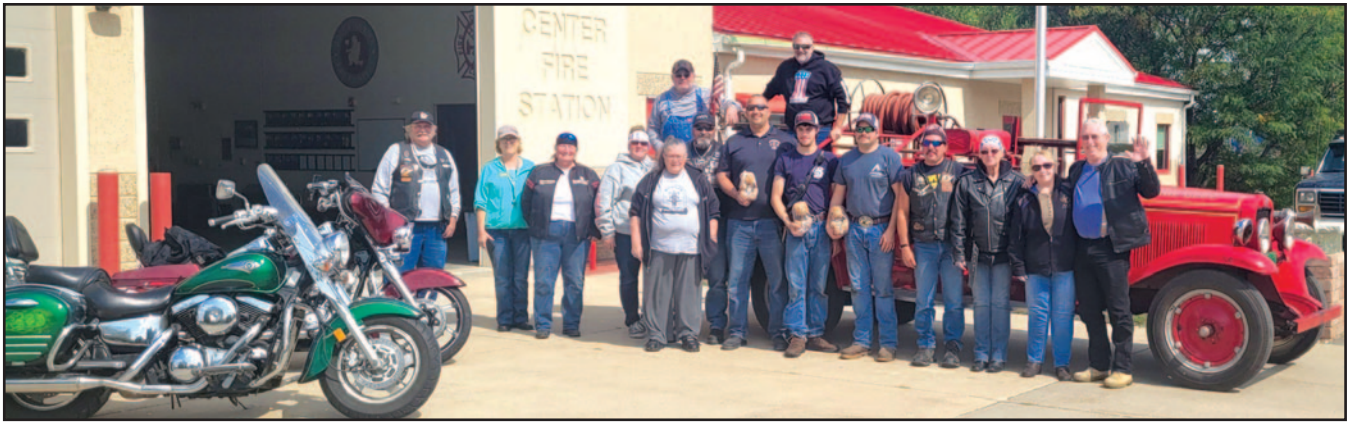
Photos from Straight River Buddy Bear ride.